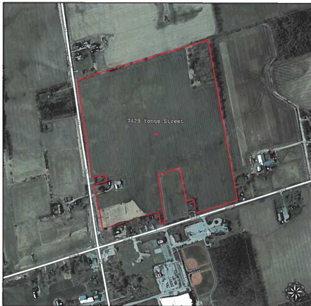
Figure 1: Air Photo ( — Subject Land)

The Subject Land is located at the north-east corner of Innisfil Beach Road and Yonge Street in the Town of Innisfil. The parcel is irregular in shape and has a lot area of approximately 36.73 hectares (90.76 acres) with a frontage of approximately 630 metres on Yonge Street as well as approximately 216 metres along Innisfil Beach Road (Figure 1). The Subject Land consist of a relatively flat topography and contains a small wooded area at the extreme north-east portion of the site. The site is predominantly devoted to agricultural and farming related processes and contains farming fields, agricultural-related accessory building and structures and accessory single detach dwelling.