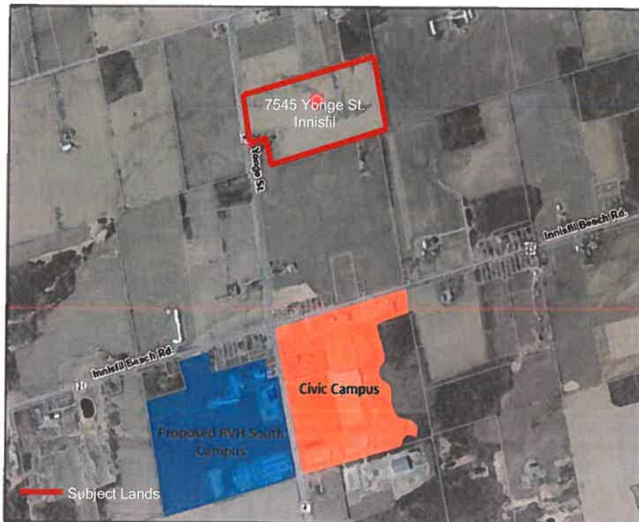
Figure 1: Subject Land Location Map