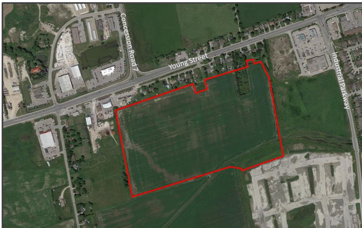
Figure 1: Air Photo of the Subject Lands

The subject lands are located adjacent to the Alliston Primary Settlement Area, being situated within the Town of New Tecumseth. The subject lands are situated within the Township of Adjala-Tosorontio. The subject lands are approximately 23.81 hectares in area, and are currently vacant agricultural lands (Figure 1).