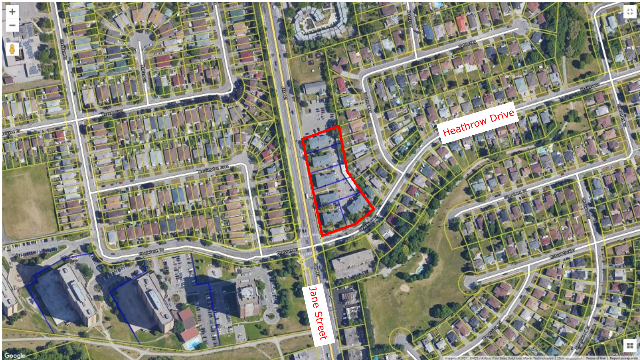
Figure 1 - Aerial Map