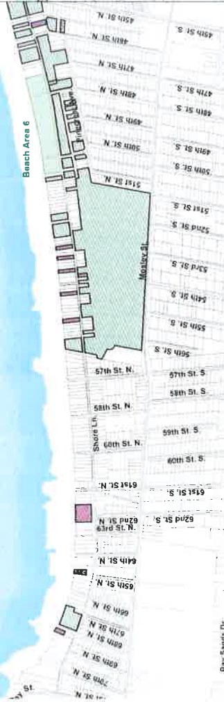
KEY MAP 3