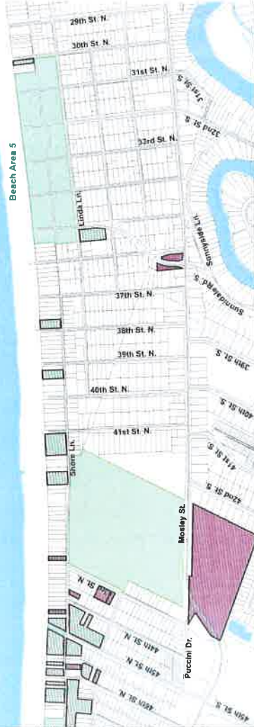
KEY MAP 4