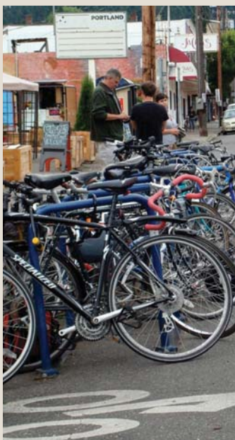
Portland State University researchers survey customers about their travel behavior outside local establishments.